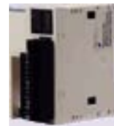
CANopen Slave Module