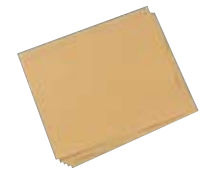
Screen Protection Sheet

Pro-face America Phone: 734.429.4971 Fax: 734.429.1010 www.profaceamerica.com