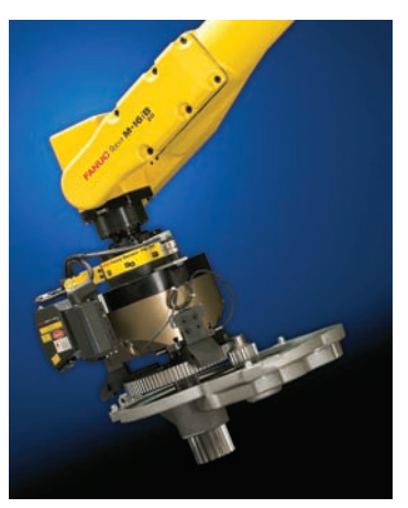
Gear Phase Match