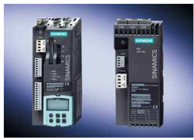
CU310 Control Unit (left) CUA31 Control Unit Adapter (right)

It is also possible to use SINAMICS S120 AC Drives in multi-axis applications. The drive is connected to a CU320 Control Unit via the DRIVE-CLiQ interface using the CUA31 Control Unit Adapter. The CU320 Control Unit then takes over the drive functions for the AC drive. SIMOTION D modules can be used as a Control Unit for motion control applications which go beyond the scope of positioning tasks. SINAMICS S120 AC Drives can also be used in hybrid operation with SINAMICS S120 multi-axis units in this configuration (Figure 2). This provides maximum flexibility for the use of SINAMICS S120 units.